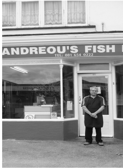
Andreou's Fish Bar 66 Shirley Road, CR0 7EP Telephone: 020 8654 0222