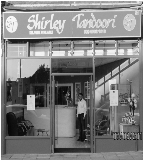
Shirley Tandoori 51 Shirley Road, CR0 7ER Telephone: 020 8654 5904