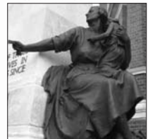
Croydon War Memorial